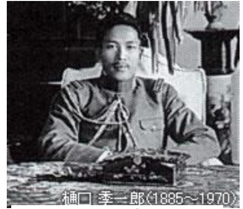
樋口季一郎(1885~1970) Japanese Army Lieutenant Higuchi, Ichirō (樋口季一郎) Saved many Jewish people

listed in the Israel’s Golden Book with another person’s name, Sugihara Chiune (杉原千畝) who is known as “Oriental Schindler” or “Japan Schindler.” Schindler is the name of a German, Oscar Schindler, who helped save the lives of Jews from a Nazi camp. They helped save lives of Jews because it is Samurai Mercy (武士の情け) and the heart of Sokuin (惻隱). Sokuin means, in the simplest term, thoughtful mind.