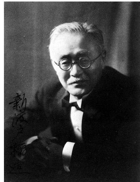
Nitobe, Inazō (新渡戸稲造) Author of a book "Bushido"

In 1900 Nitobe (新渡戸) Sensei wrote a book called "Bushido." This book, written in English, introduced the world the concept of Bushido, the way of life, the way of death as a central Japanese spirit. Japan, at that time since the Meiji Restoration, was only one country in Asia undergoing an industrial revolution put up with the Japanese spirit called "Wakon (和魂)" and was developing at full speed. Everyone in Western European countries was interested in finding out the secret, what it is, of such a big development in Japan. Nitobe Sensei, then, introduced Japan's Bushido to the world, saying that the secret is the Bushido, central Japanese spirit. This book created a sensational echo among people all over the world as soon as published the first edition. Among them, was that the United States President Theodore Roosevelt read this book overnight despite his busy schedule. And it impressed him so much that next day he bought 30 books and distributed them to dignitaries around the world recommending to read through. Then after a while, there was a Russo-Japanese War, the war between Japan and Russia. Theodore Roosevelt played at that time an important role of the mediation for the peace treaty between Russia and Japan. The War ended with his mediation finally because he understood Japanese Bushido and deeply resonated with the concept.