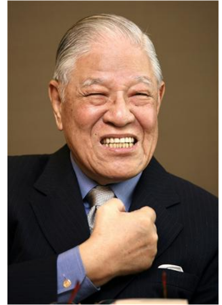
Lee, Teng-hui (李登輝) "Father of Taiwan's democracy"