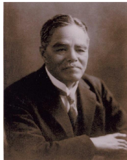
Uchimura, Kanzo (内村鑑三)